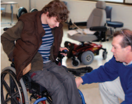
Good Shepherd provides custom adaptations to wheelchairs and seating based on individual patient needs.