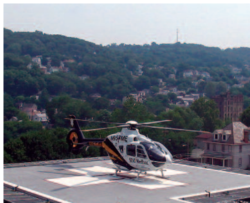
East Liverpool City Hospital serves the tri-state region of Ohio, Pennsylvania, and West Virginia. Recently completed construction enables helicopters transporting critical patients to land right next to the emergency room.

Coverage. ISS Solutions is the single point-of-contact for clinical engineering at East Liverpool City Hospital because they have extensive experience with all types of equipment. ISS Solutions’ depth of coverage includes providing preventative maintenance and equipment repair as well as management of OEM contracts for specific devices. Hospital department heads have confidence that their equipment is serviced properly and,